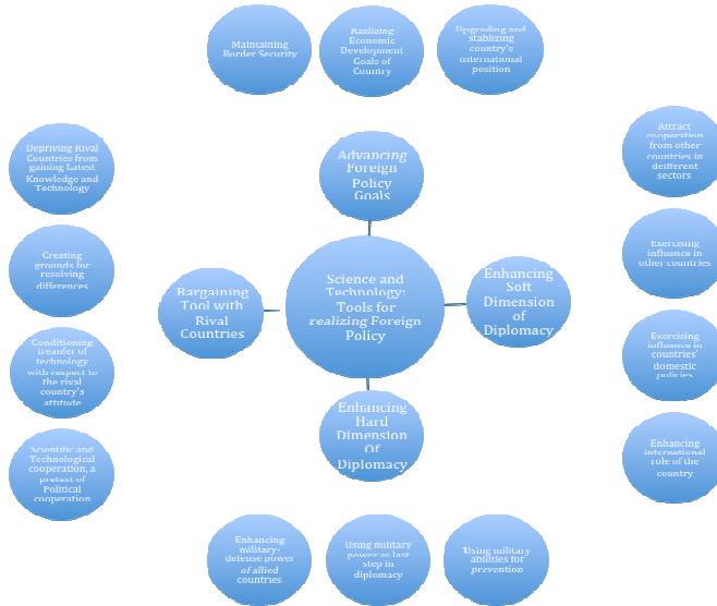
Figure 1: Science and technology as a tool for realizing foreign policy

In reviewing the role of foreign policy in development of science and technology, 4 sectors have been identified namely: adoption of an open strategy in foreign policy for strengthening scientific and technological capacities; application of foreign policy capacities and tools for development of science and technology; preparing ground for development of new and superior technologies through international cooperation; and use of political bargaining in preventing the rival government to have access to science and technology which can tilt the balance of power in-favor of the rival. Each of these has strategies shown in figure 2.