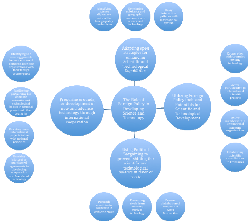
Figure 2: Role of foreign policy in development of science and technology.

With respect to interaction between foreign policy and science and technology, strategies that shape the diplomacy of technology have been extracted. These strategies, as pointed out, can be divided in four main axes in each scenario. With each further divided into sub strategies. These strategies show the main axes in science and technology diplomacy for the promotion of scientific cooperation between and the Islamic countries. It is worth mentioning here that depending upon their power and status and international and the level of science and technology that they enjoy, countries can benefit from some of these strategies.